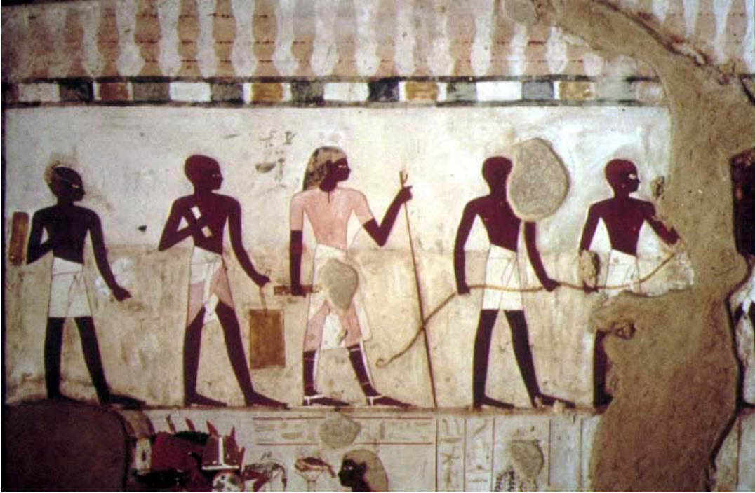
Scribe Djoserkarseneb carrying out a survey of the crops

So it is clear that the Cadastre Scribe was not always a welcome sight to those farmers whose productivity was insufficient to meet the burden of their taxes, but it is evident from his horse and chariot (see photograph) that Menna was a figure of status and wealth through his service to the Temple bureaucracy.