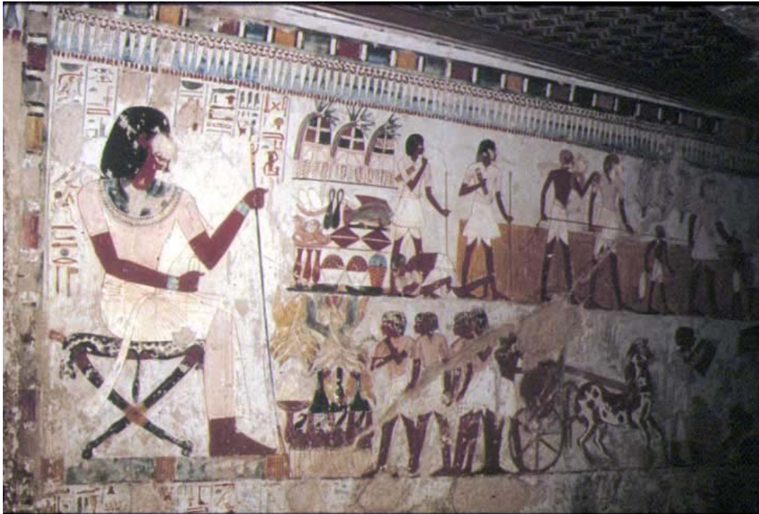
Scribe Menna looks authoritatively over his surveying party